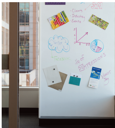
Create a collaborative environment using 3M™ DI-NOC™ WH-111 Whiteboard Film.