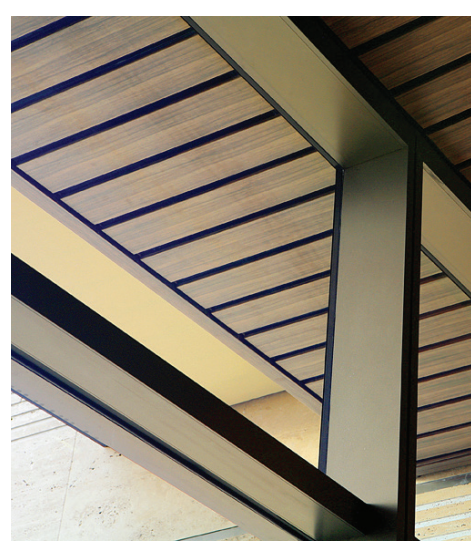
Bring warmth and design to unexpected areas.